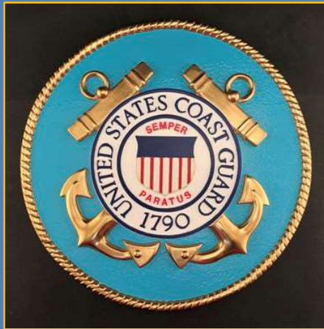
U.S. Coast Guard Ref #6001FC | 15" Butyrate Full Color Seal