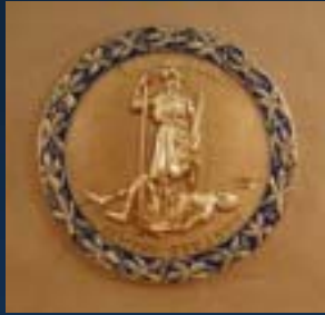
Dark Blue | PMS 280